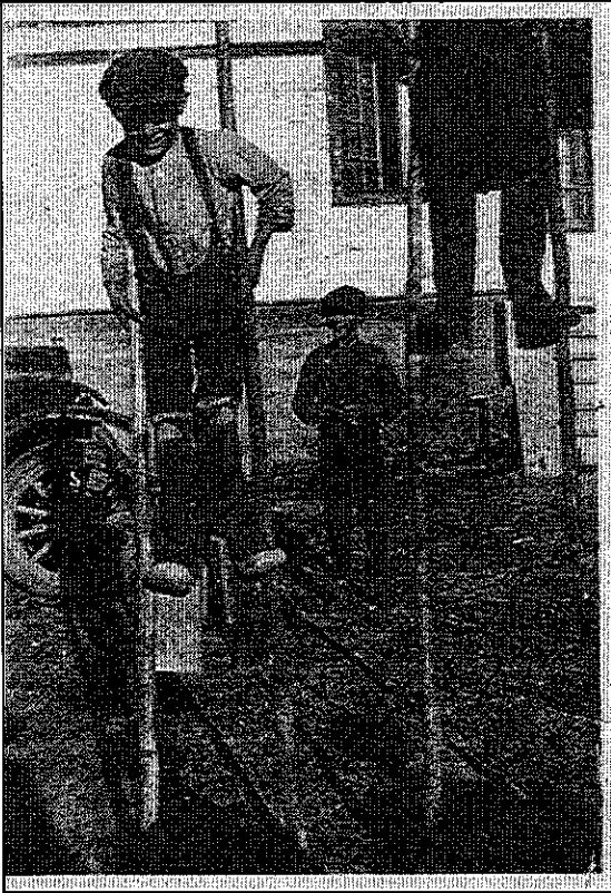
Who are We?