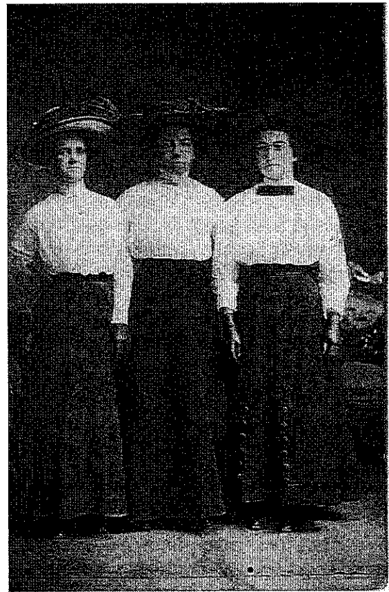
Postcard "Victor Postal" with note of "May 28th 1913" added

Copyright © 2011 by The Osgoode Township Historical Society. All rights reserved. No part of this newsletter may be used or reproduced in any manner whatsoever without prior written permission, except in the case of brief quotations embodied in reviews.